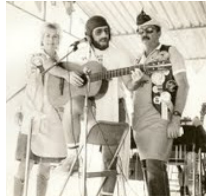
The first Chili Cook-off, 1978.