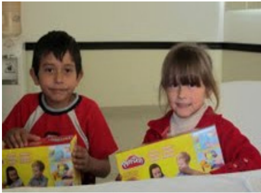
Christmas at Jocotepec clinic 2011.